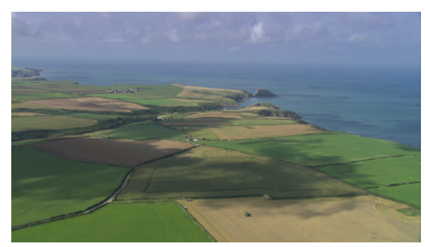
Ynys Deullyn and Ynys y Castell guard the secretive little harbour of Abercastle.