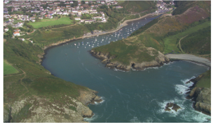
Solva is effectively divided into two: Lower Solva