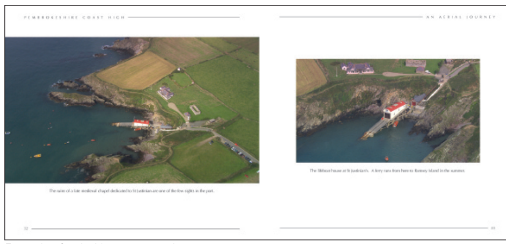
Example of a double page spread.